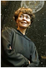
The Honorable Audrey B. Collins, Chief Judge, United States District Court, Central District of California