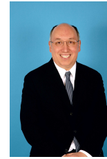
The Honorable Fernando M. Olguin, Judge, United States District Court, Central District of California