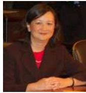
The Honorable Dolly M. Gee, Judge, United States District Court, Central District of California (moderator)